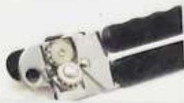
2 can opener