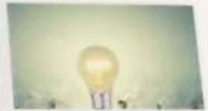
3 light bulb