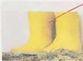
5 rubber boots