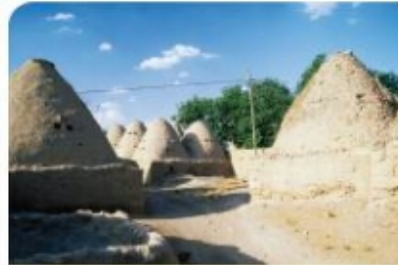
1 Beehive houses in Turkey

These houses are called beehive houses. Beehive houses are made of mud, water and dry grass. People build beehive houses in some hot, dry places. The mud walls and very small windows keep the homes cool.