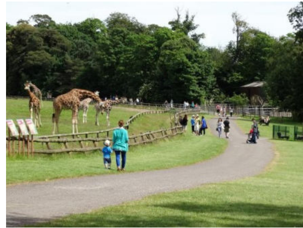
a wildlife park