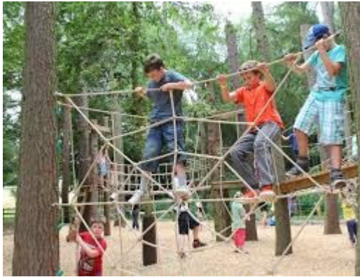
an adventure playground