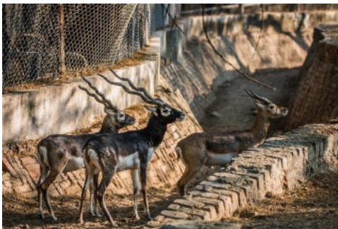
a zoo park