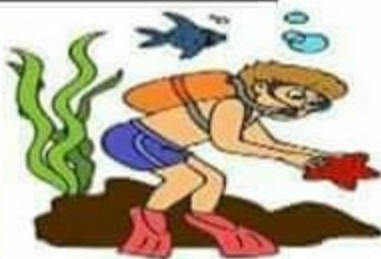
go scuba diving